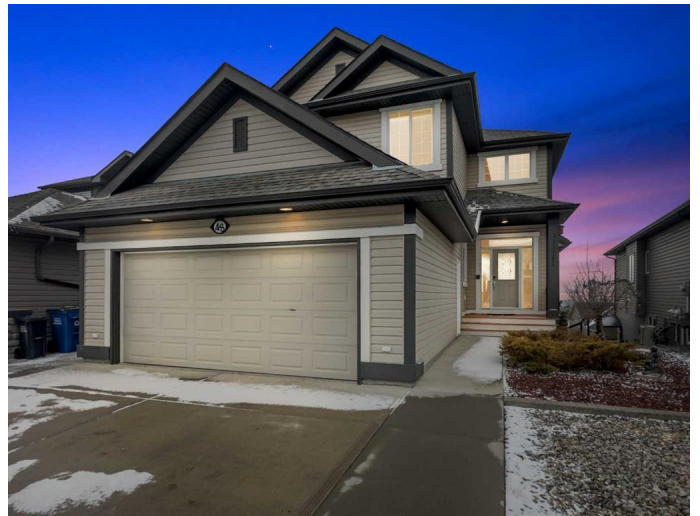
48 Sunset Ct, Cochrane, AB

Step inside to find a sun-filled interior, with large windows framing the breathtaking mountain vistas. Hardwood floors lead you from the welcoming foyer into the expansive living space, where the kitchen, dining, and living room flow seamlessly together. The gourmet kitchen features beautiful cabinetry, a large wrap around eat-up island that easily sits 8, granite countertops, stainless steel appliances, ample pantry space—perfect for both cooking and entertaining. Off the large kitchen dining, an patio space ideal for hosting barbecues, reading a book or simply enjoying the stunning mountain views, sunsets and nature at large. The cozy living room includes a gas fireplace, setting the tone for a warm and inviting space to relax during our cold